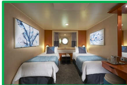
Oceanview Cabin - OA