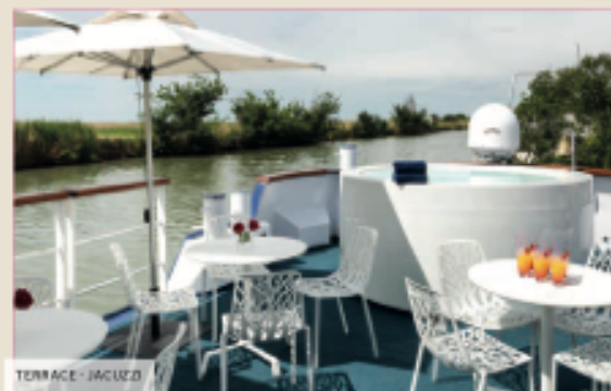
TERRACE - JACUZZI

The MS Anne-Marie is a beautiful Premium canal barge, measuring 38,50 meters long and 5,07 meters wide. It can accommodate 22 passengers, in 11 cabins spread over two decks. The size of the cabins is 9 m 2 (including a PRM cabin of 11 m 2 ) offering amenities and providing guests with all the comforts they need during their stay. On board, everything has been taken care of down to the smallest detail and the 6 crew members guarantee a personalized service. The decoration is stylish with an elegant and intimate at-