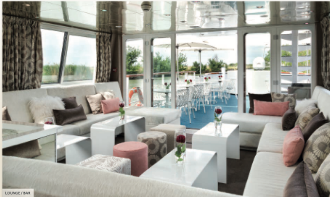
LOUNGE / BAR

A cruise aboard a canal barge promises a peaceful break where you take the time to discover "la douce France" in a different way. The MS Anne-Marie, a true cocoon of charm, sails on the French canals and offers its passengers an original and authentic experience.